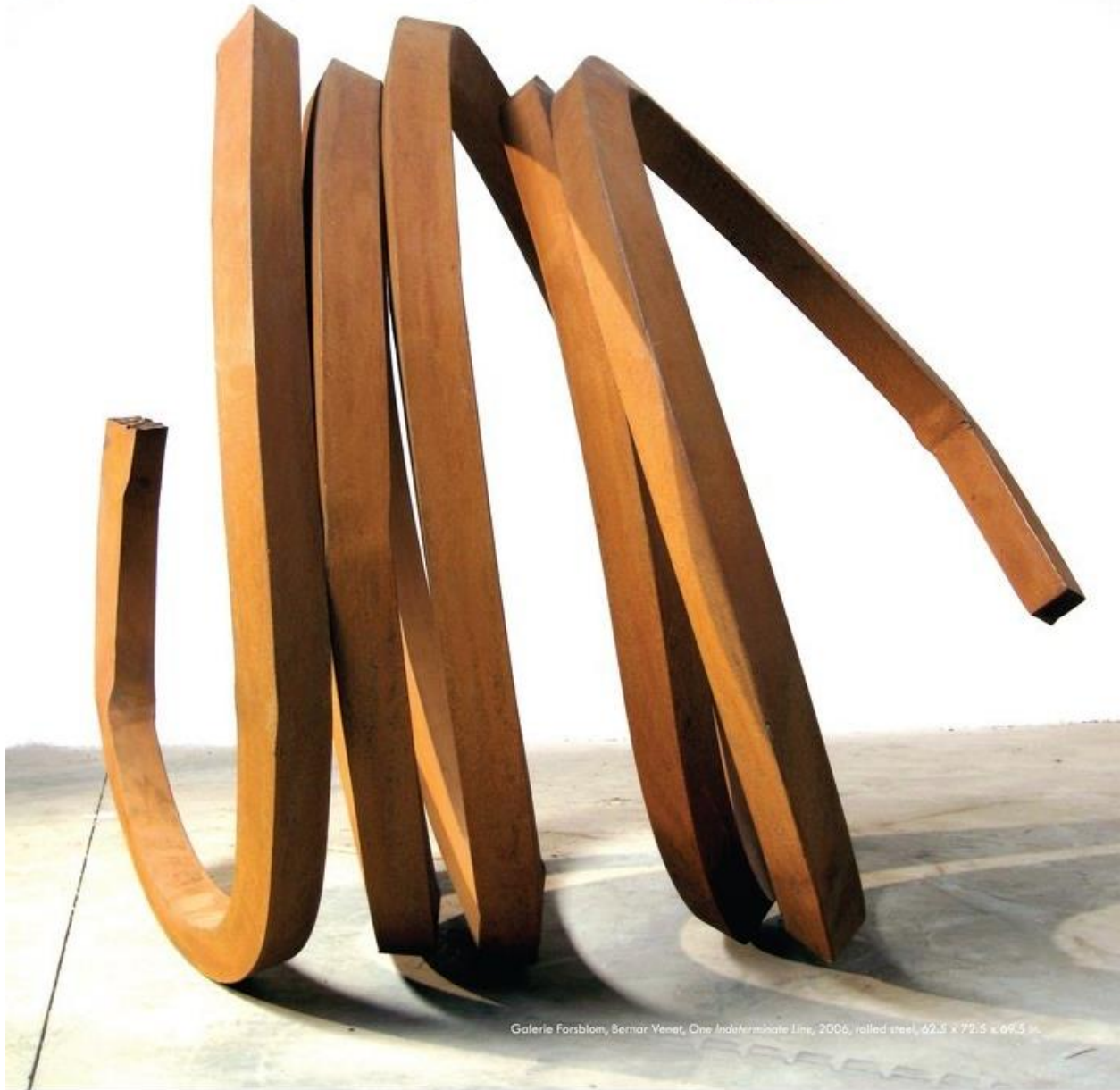
Galerie Forsblom, Bernar Venet, One Indeterminate Line , 2006, rolled steel, 62.5 x 72.5 x 69.5 cm

Founded in 1977, Helsinki's Galerie Forsblom focuses on established and emerging artists, both Finnish and international. Forsblom's mission is twofold: to bring interesting not-before-seen art to Finland, and also to place Finnish art in the larger context of the international scene. While 2014's Dallas Art Fair marks the gallery's first foray into Texas, Forsblom maintains a high profile on the art fair circuit, exhibiting annually at seven to 10 fairs all over the world. Galerie Forsblom's roster is diverse and inclusive, embracing work from expressionist to minimalist, cutting-edge painting to more traditional sculpture, and everything in between. Of the seven artists it's showing, don't miss the sculpture of renowned American artist Joel Shapiro, Bernar Venet's 3-D conundrum One Indeterminate Line , New York painter Peter Halley's geometric acrylic works, and Brit Jason Martin's shimmering monochromatic oils on aluminum. galerieforsblom.com