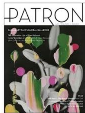
On the cover: Nanna Hänninen, Plant II , 2011, C-print, diasec, mounted on mat/oak, 63 x 48.4 in.