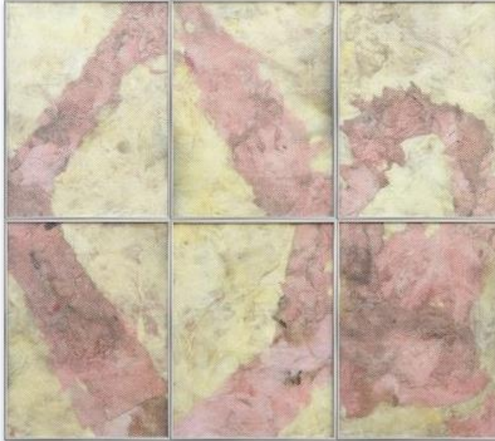
Brand New Gallery, Ryan Conrad Sawyer, R-3, 2013, fiber-reinforced polymer and fluorescent diffuser, 42 x 54 in.