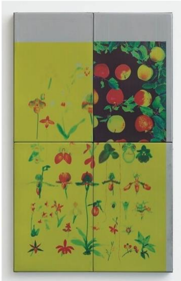
Ribordy Contemporary, Zak Kitnick, American Ships, Fusion (3/4 orchid, 1/4 modern apples, upper right), 2013, direct-to-substrate print on powder-coated steel shelving, 47 1/2 x 29 1/2 x 1 1/4 in.