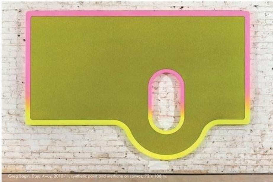
Greg Bogin, Days Away, 2010-11, synthetic paint and urethane on canvas, 72 x 108 in.