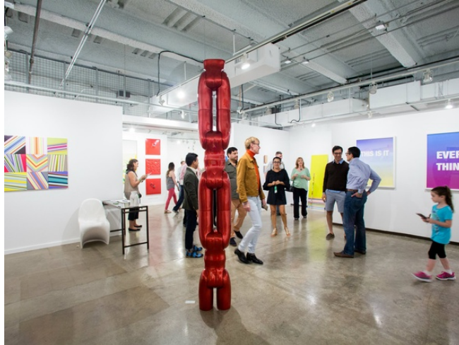
Get into the Dallas Art Fair for free on Professionals Day April 10.

The seventh annual Dallas Art Fair runs April 10-12 at Fashion Industry Gallery, and we have a way to see art from more than 100 local, national and international galleries for free.